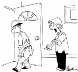
"You're going to school dressed like that? I can hardly see your underwear!"